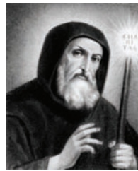
April 2 nd ST. FRANCIS OF PAOLA Patron of Mariners

Francis was born at Paola, Italy, about the year 1416. His parents were very poor but virtuous. Francis was educated at the Franciscan friary of San Marco. At fifteen he became a hermit near Paola. In 1436, he and two companions began a community that is considered the foundation of the Minim Friars. Some fifteen years later he built a monastery where he had led his eremitical life and set a Rule for his followers emphasizing penance, charity, and humility, and added to the three monastic vows, one of fasting and abstinence from meat; he also wrote a rule for tertiaries and nuns. The Order was approved by Pope Sixtus IV in 1474 with the name Hermits of St. Francis of Assisi (changed to Minim Friars in 1492). Francis established foundations in southern Italy and Sicily, and his fame was such that at the request of dying King Louis XI of France, Pope Sixtus II ordered him to France, as the King felt he could be cured by Francis. He was not, but was so comforted that Louis' son Charles VIII, became Francis' friend and endowed several monasteries for the Minims. Francis spent the rest of his life at the monastery of Plessis, France, which Charles built for him. Francis was credited with many miracles and had the gifts of prophesy and insight into men's hearts. Francis died there on April 2nd and was canonized in 1519.